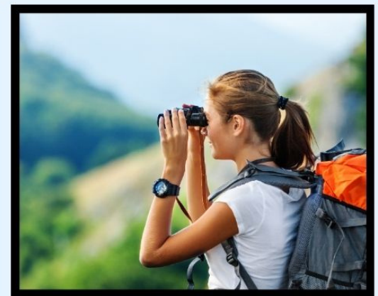
Outdoor Adventure 2025